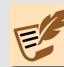
Estate, Probate, & Elder Law